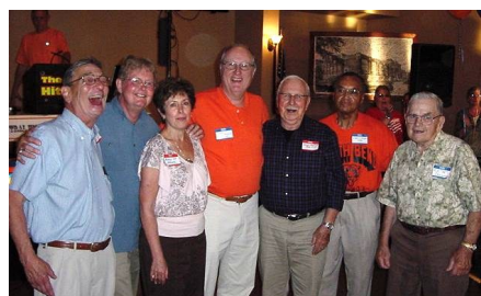
A gathering of Bears