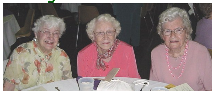
A trio of Riley lasses from the 1930's